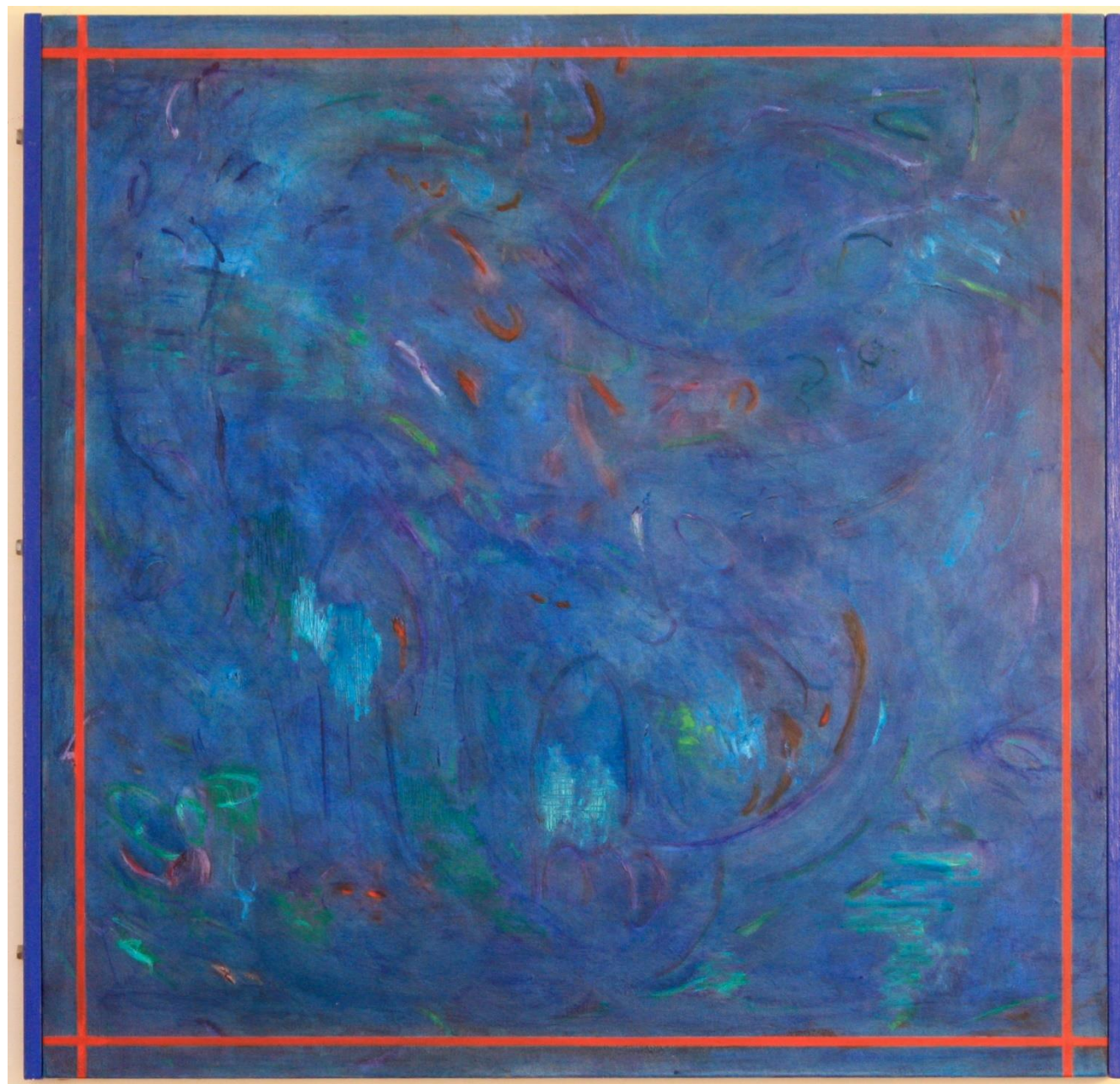
1. Hau uru, West Wind Oil paint on rabbit skin gesso on board 620x600mm