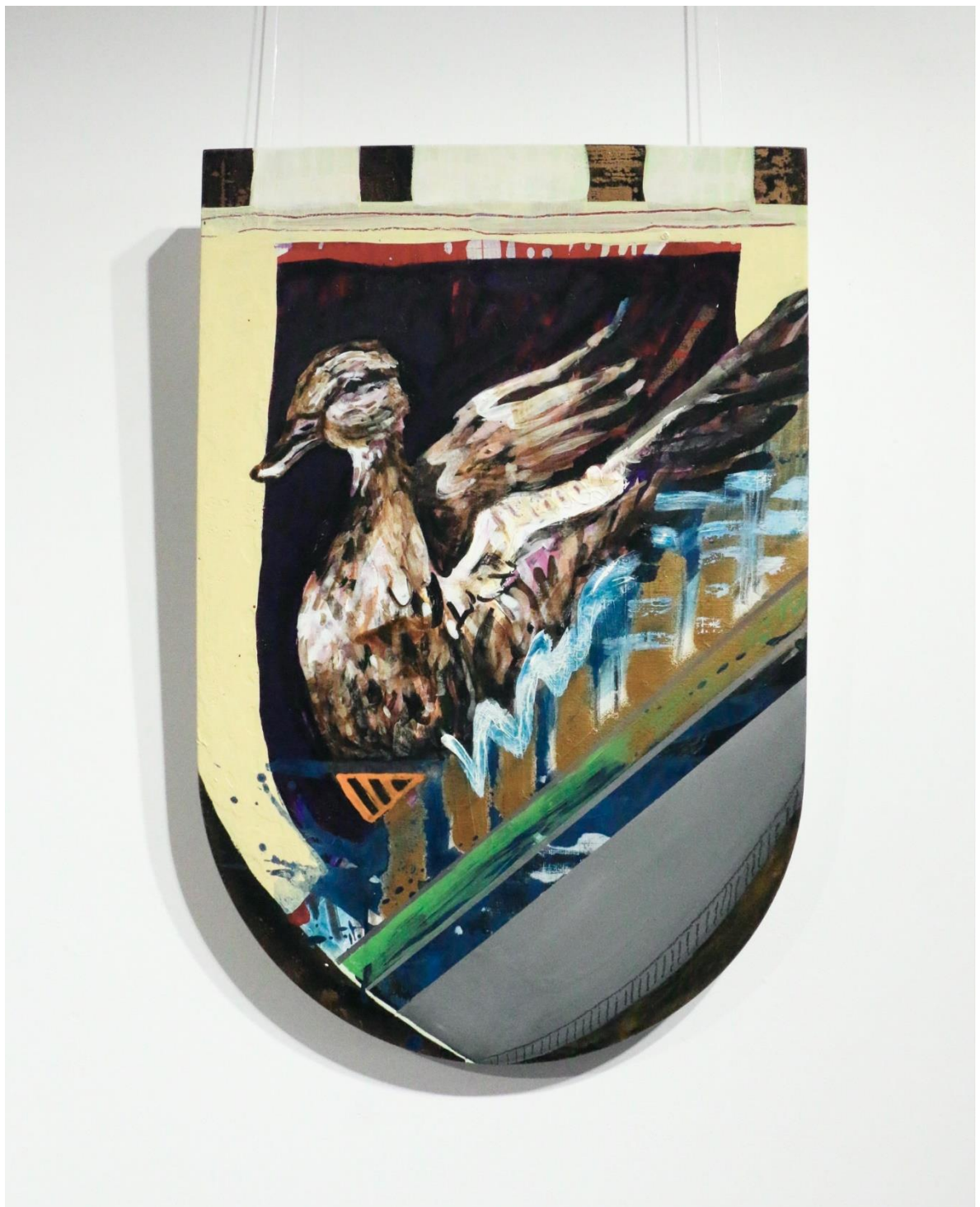
Wallace Gallery Morenawhira Morrinsville, 167 Thames Street Whakāturanga Gallery 30 April – 29 May 2022 Gallery Hours: Tues- Fri 10am – 3pm | Weekends 11am – 3pm