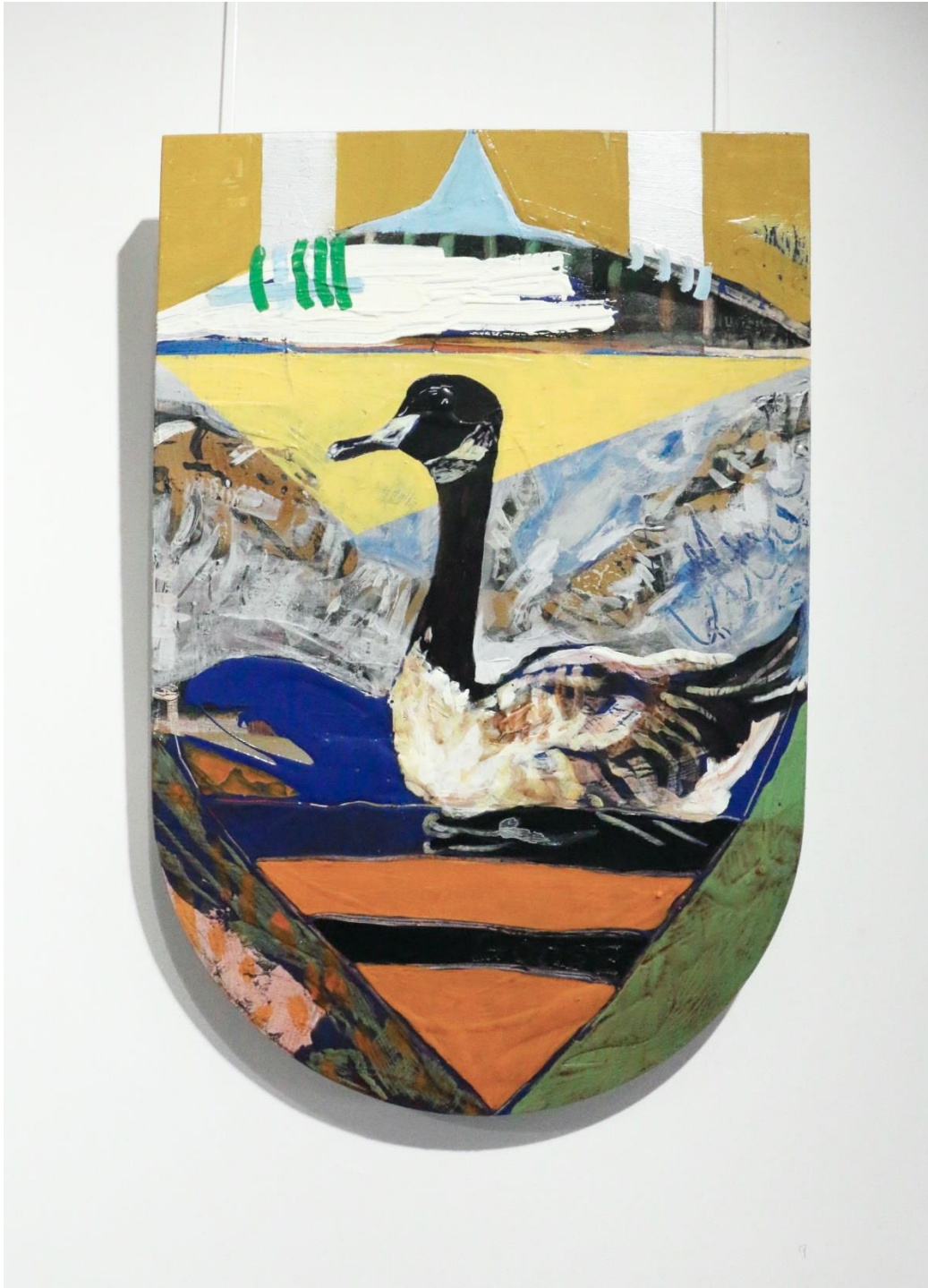
Wallace Gallery Morenawhira Morrinsville, 167 Thames Street Whakāturanga Gallery 30 April – 29 May 2022 Gallery Hours: Tues- Fri 10am – 3pm | Weekends 11am – 3pm